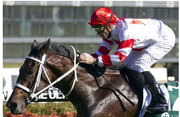
Writteninthestars saluting the judge at Canterbury on 24.5.12

Up and coming sire Written Tycoon produced another city winner on Wednesday when Writteninthestars was a dominant winner at Canterbury. Writteninthestars, from the same family as superstar mare Sunline, was first up from a spell having had two starts last preparation for one placing. From the jump she was able to dictate terms in front and cleared out from the field over the final 200m beating the stable mate Homedge by a length and a further five back to the rest. Written Tycoon, a relatively underrated stallion, has made his presence felt since his first season in 2008 with 30 winners from 57 runners at the track. He was most recently represented with a stakes win at Eagle Farm by Trump who took out the Gunsynd Classic over 1600m.