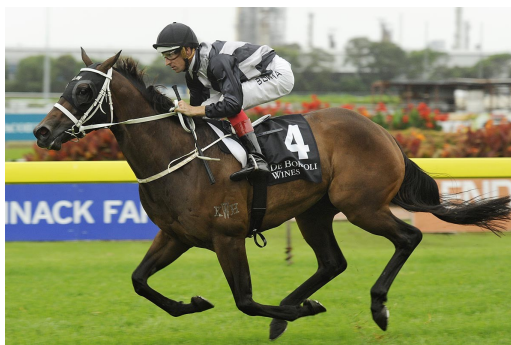
Red Tracer looks set to light up the turf Saturday

Tromso returns to racing fresh and on the back of a strong trial along with Red Tracer who put in a dominant display at the Hawkesbury trials on Monday. Ironically the weather will play a role in determining if either horse runs with Tromso needing a dry surface and Red Tracer looking for a track with sting out of the ground.