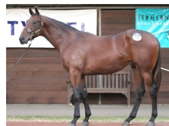
2010 Sebring x Devils Marble Colt