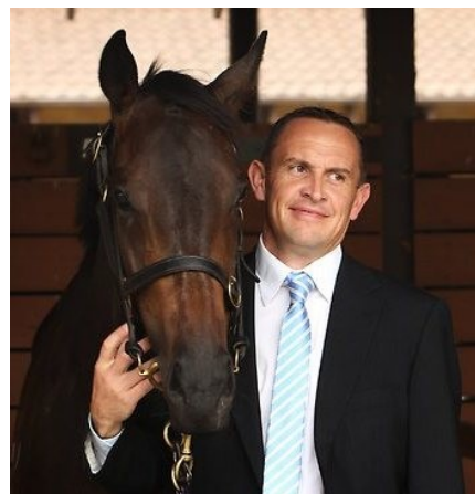
Enjoyable times at the Races