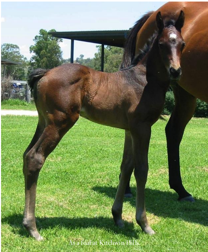
As a foal at Kitchwin Hills