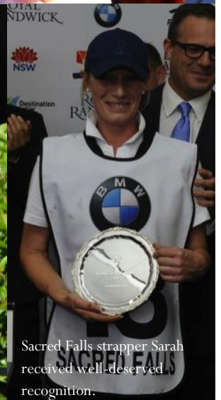
Sacred Falls strapper Sarah received well-deserved recognition.