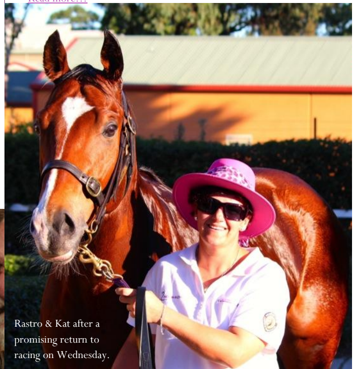
Rastro & Kat after a promising return to racing on Wednesday.