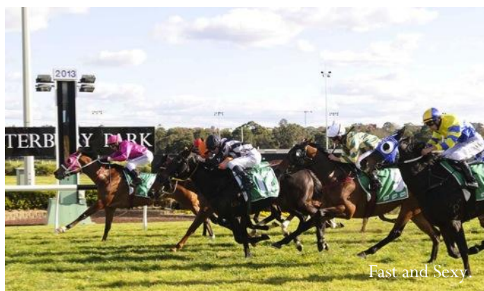
Fast and Sexy.