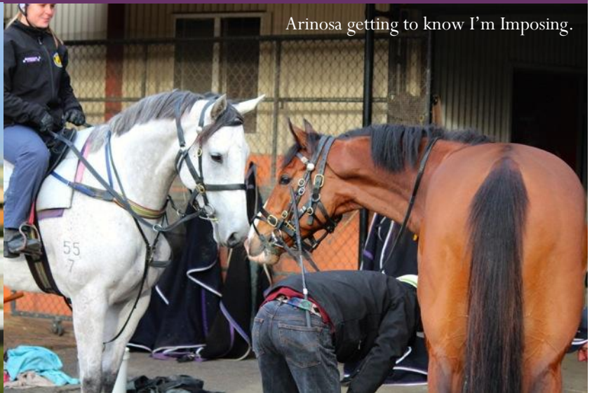
Arinosa getting to know I'm Imposing.