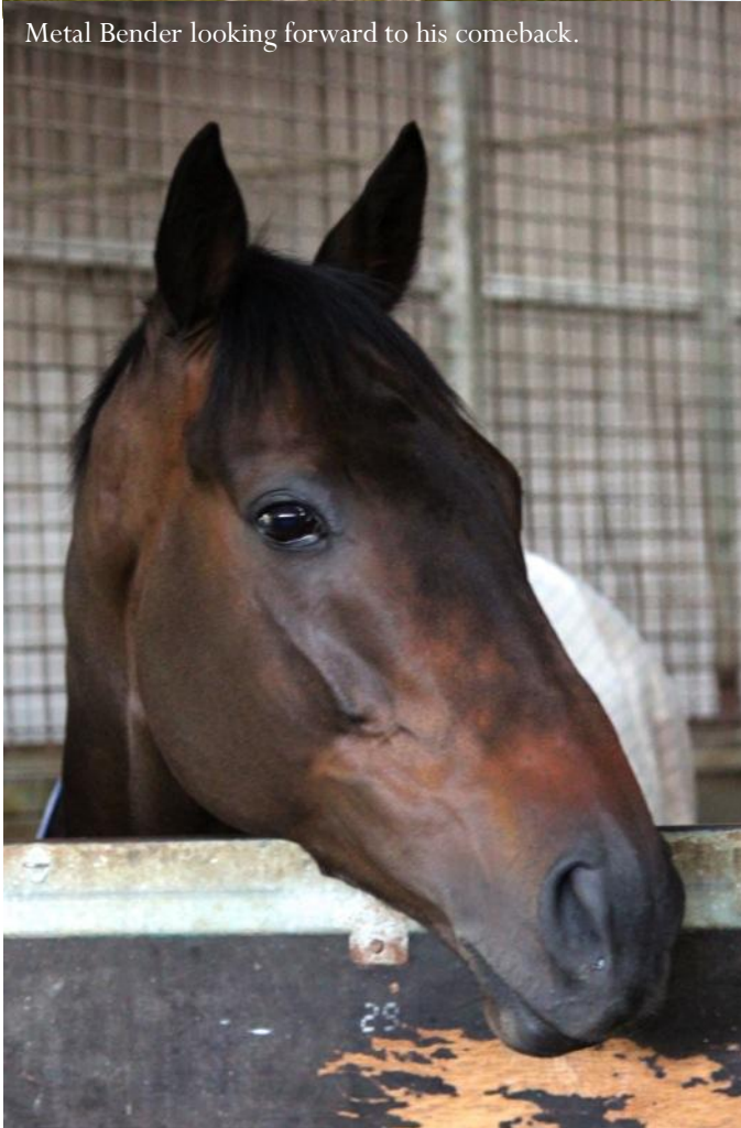
Metal Bender looking forward to his comeback.