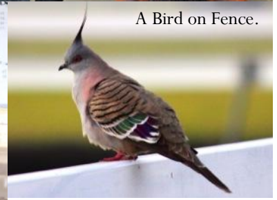
A Bird on Fence.