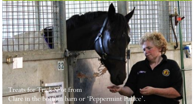
Treats for Trick Shot from Clare in the bottom barn or 'Peppermint Palace'.