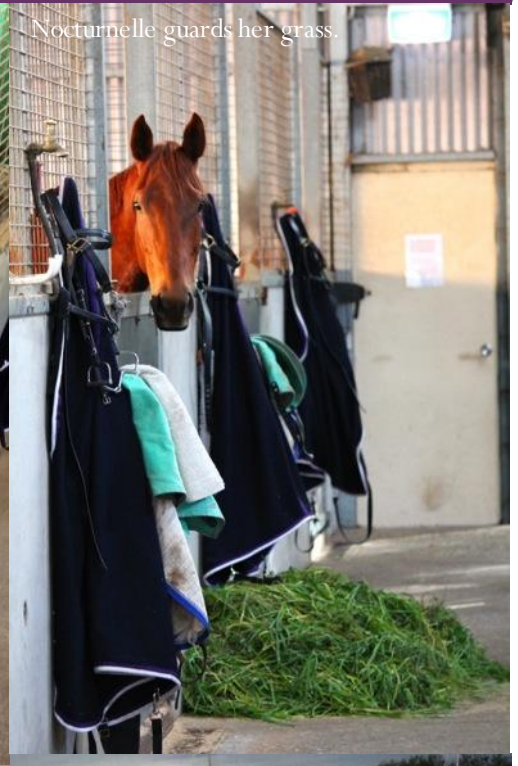
Nocturnelle guards her grass.