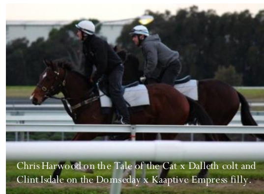
Chris Harwood on the Tale of the Cat x Dalleth colt and Clint Isdale on the Domseday x Kaaptive Empress filly.

With a lot of the stable's star performers out spelling and pre-training it makes room for this year's yearlings to come and have a look around Rosehill. They have been broken in, spelled and had refresher courses at the respective farms and are now taking the next step in their development, being introduced to the busy city stable environment and the routine that goes with it. By adding gradual pressure to their bodies, this time is also used to kick start some physical development from them, stimulating bone and muscle creation while strengthening tendons and ligaments. For an interesting look at the anatomy, physiology and how the horse's body is tested under race pressure, an interesting documentary called Inside Nature's Giants is worth watching if you can stomach it as it involves a dissection. It's sure to take your appreciation of these amazing animals to another level and gives a better understanding of the importance of giving them time to strengthen and develop. Click here to view.