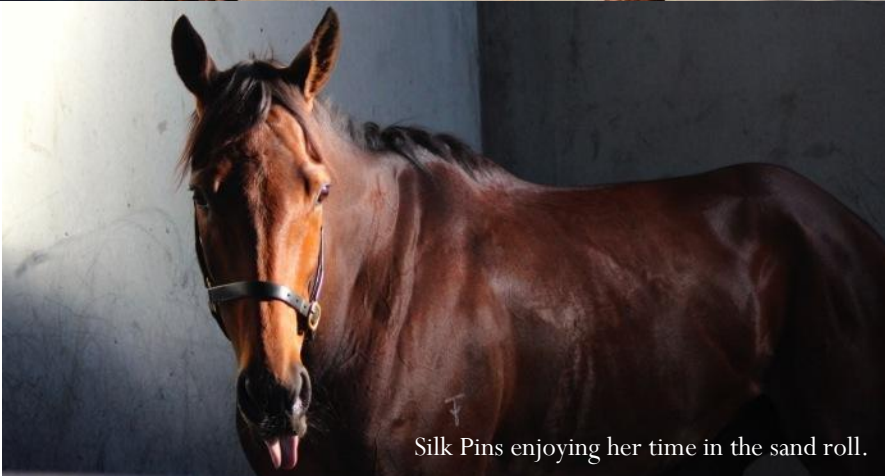
Silk Pins enjoying her time in the sand roll.