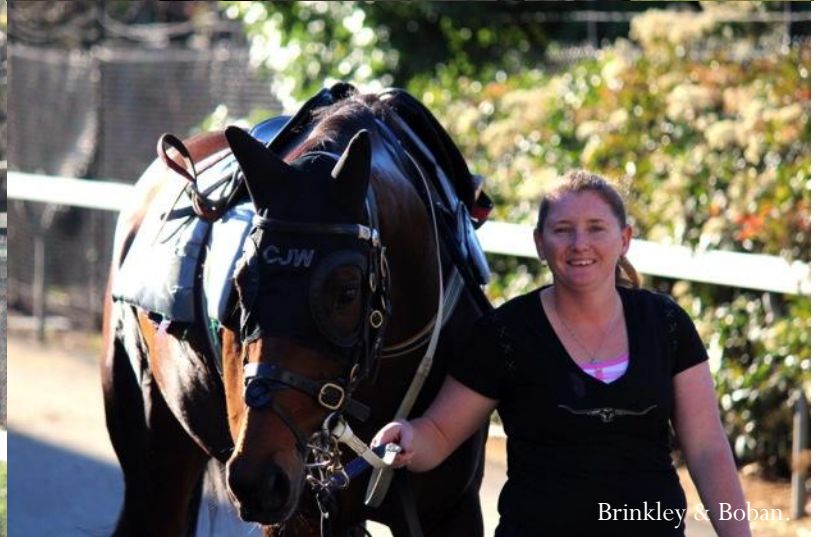
Brinkley & Boban.

For more news from the stable visit the website www.cwallerracing.com