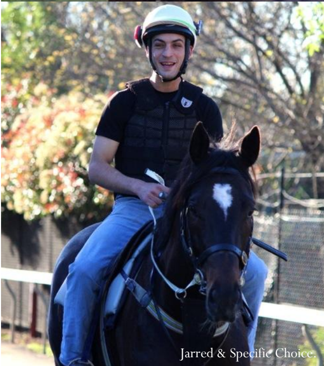
Jarred & Specific Choice.