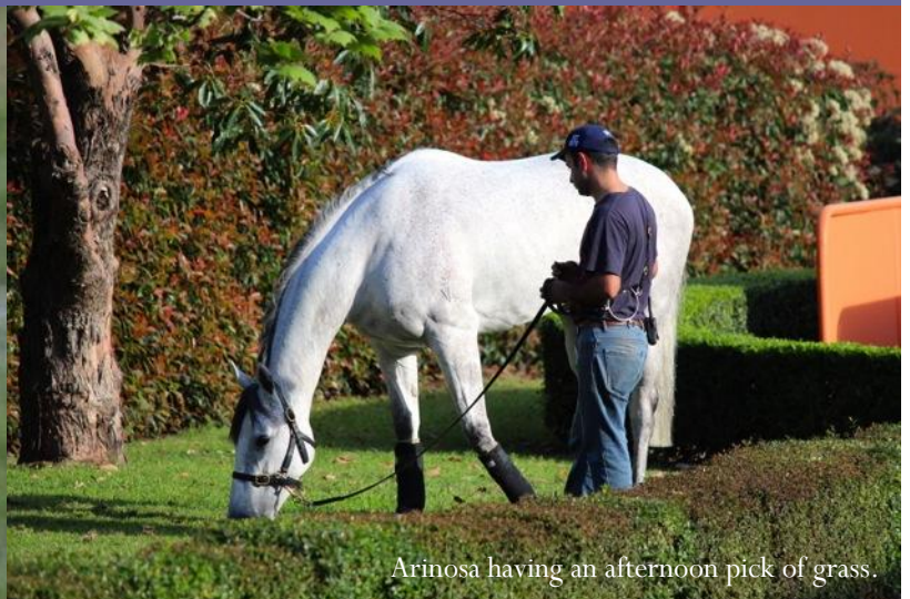
Arinosa having an afternoon pick of grass.