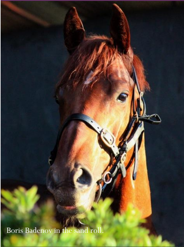
Boris Badenov in the sand roll.