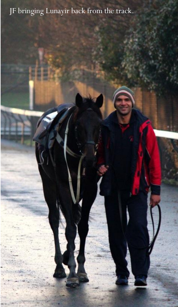
JF bringing Lunayir back from the track.