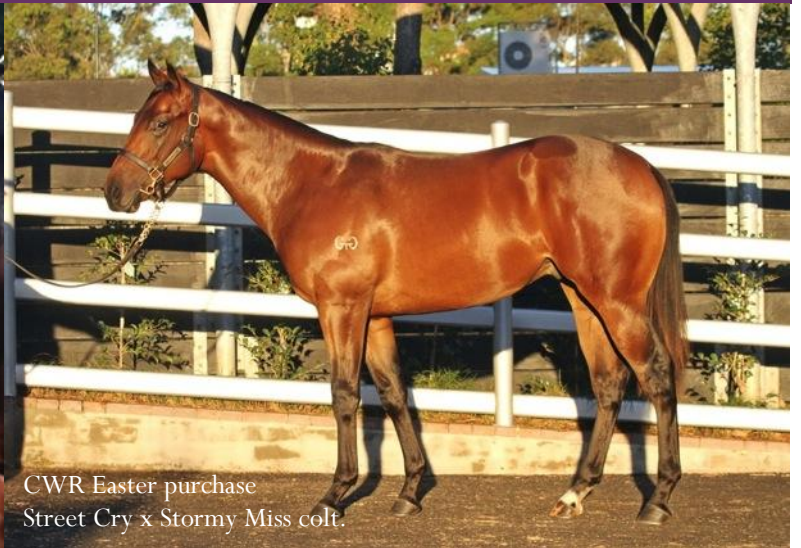
CWR Easter purchase Street Cry x Stormy Miss colt.