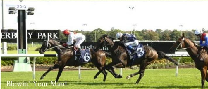
Blowin' Your Mind