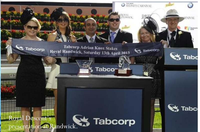
Royal Descent's presentation at Randwick.