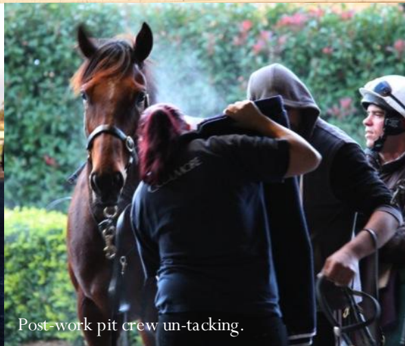
Post-work pit crew un-tacking.