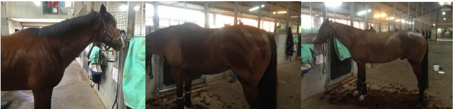
Follow the leader – yearlings having their first look around Rosehill.