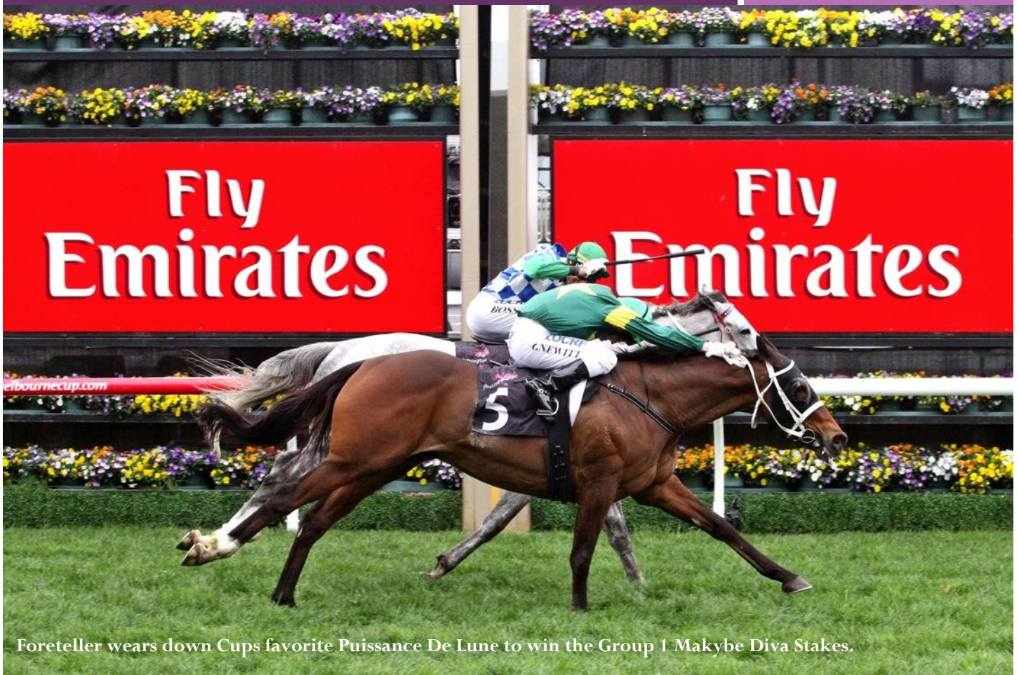
Foreteller wears down Cups favorite Puissance De Lune to win the Group 1 Makybe Diva Stakes.