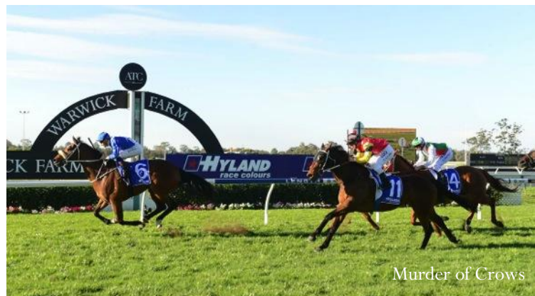
Murder of Crows