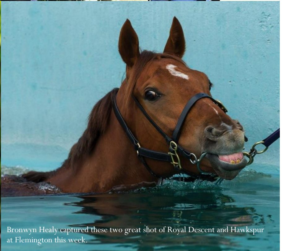
Bronwyn Healy captured these two great shot of Royal Descent and Hawkspur at Flemington this week.