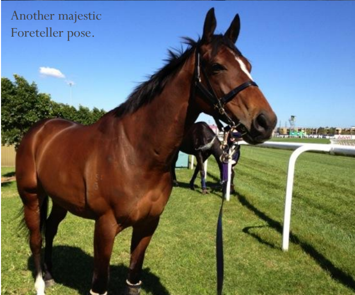
Another majestic Foreteller pose.