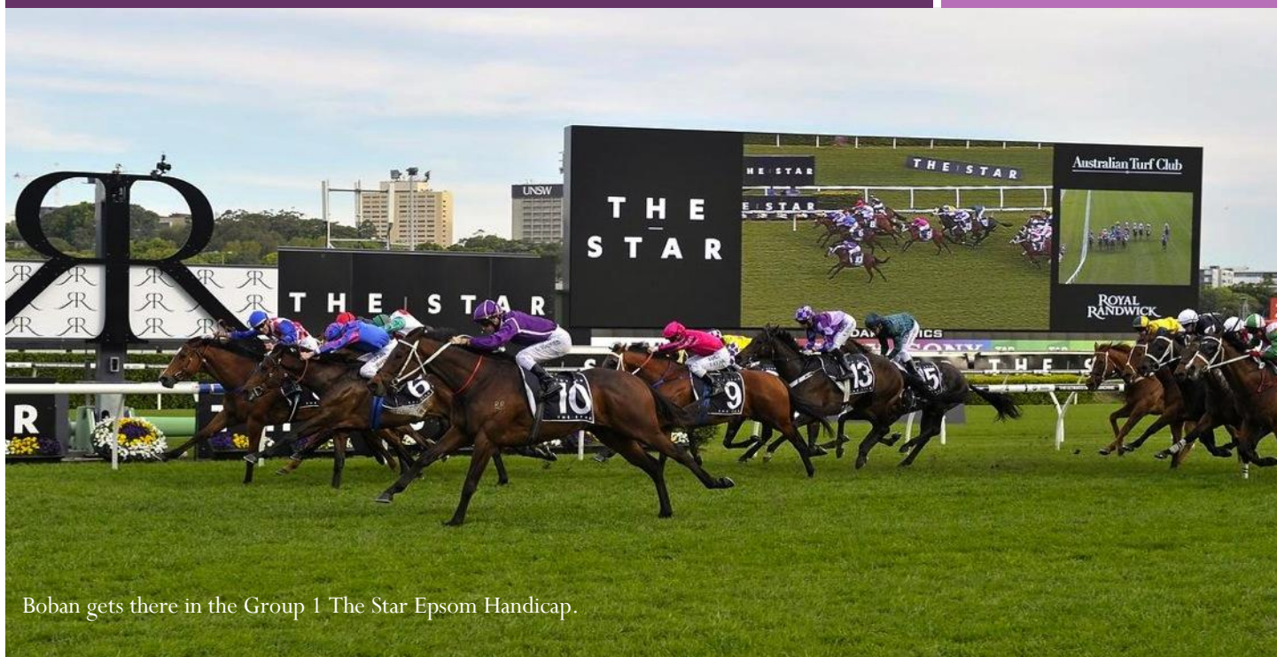
Boban gets there in the Group 1 The Star Epsom Handicap.

Boban would have lost no admirers and would have gone down as an unlucky second in the Group 1 $500,000 The Star Epsom Handicap had the tiniest of margins against us been found by the judge at Randwick on Saturday. Not having any favors in the run, it was a mammoth effort, needless to say we're incredibly proud of him and the way he's matured and adapted his ring craft to get to this level. Raising the roof in the winner's bar, his elated owners made special mention of 'the journey' they've had with the horse - something we can relate to with every single horse in the stable.