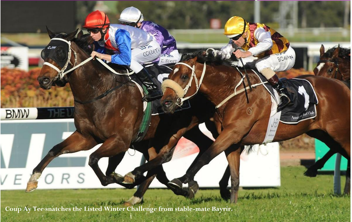
Coup Ay Tee snatches the Listed Winter Challenge from stable-mate Bayrir.

Three winners plus a few hard luck stories saw a super start to the 2013-2014 racing season for the stable at Rosehill on Saturday. It was nice to kick off with great results and reassure ourselves that we're on track for another exciting 12 months.