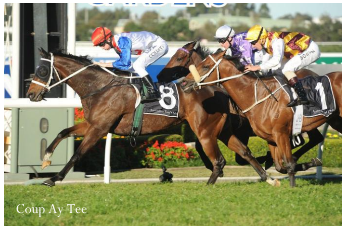
Coup Ay Tee