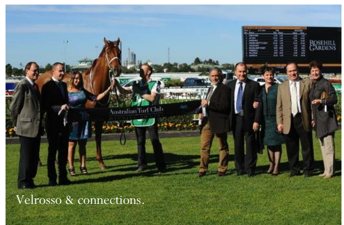
Velrosso & connections.