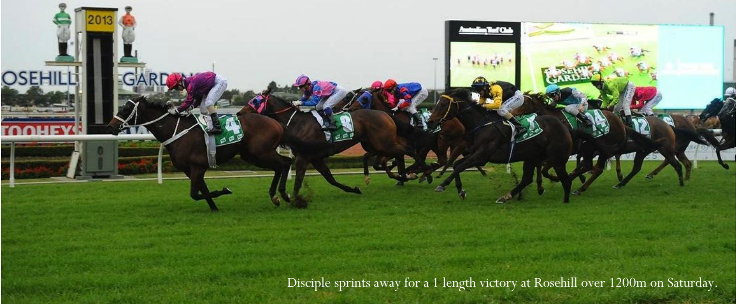
Disciple sprints away for a 1 length victory at Rosehill over 1200m on Saturday.

Another four winners were added to the stable's Sydney metropolitan tally this week, taking us to 147.5 for the season. At Rosehill on Saturday Disciple replicated his first up win while Canterbury on Wednesday proved a happy hunting ground for the team with a treble courtesy of Rastro, Chateau Lafaute and Done Nothin' Wrong.