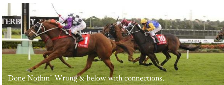
Done Nothin' Wrong & below with connections.