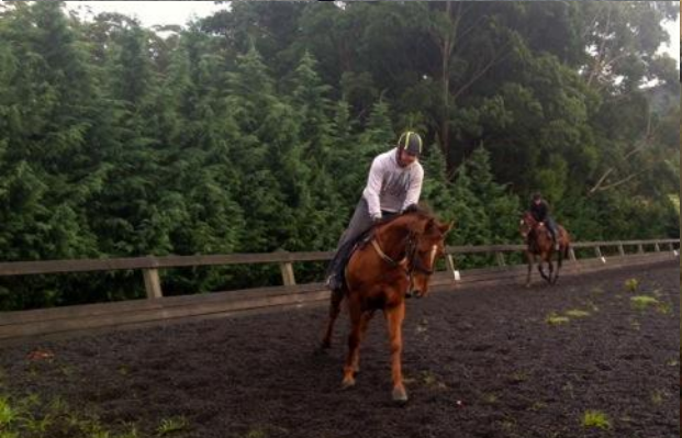
The all-weather surface at Boynton Park ensures that despite the weather, it's business as usual for the horses in pre-training there.