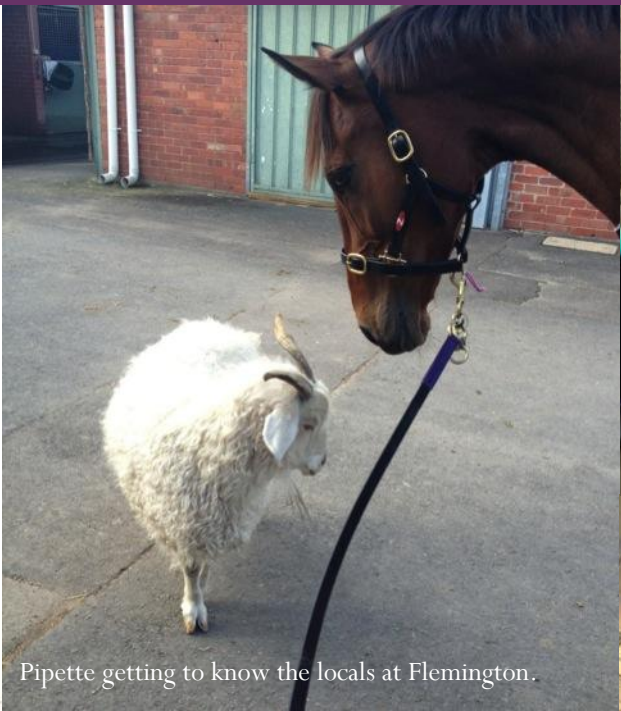
Pipette getting to know the locals at Flemington.