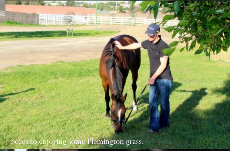
Secessio enjoying some Flemington grass.