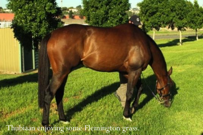
Thubiaan enjoying some Flemington grass.