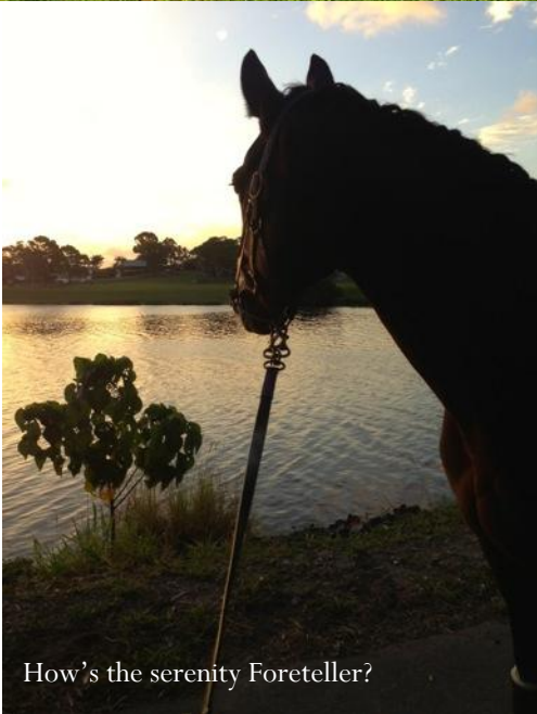
How’s the serenity Foreteller?