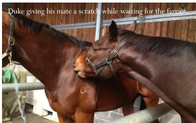
Duke giving his mate a scratch while waiting for the farrier.

It was a bad week for toe clips with young Duke following Reliable Man's lead and standing on one of his, holding up his pre-training for a few days. After a visit from the farrier he is now back on track and had a gallop this morning at Boynton Park.