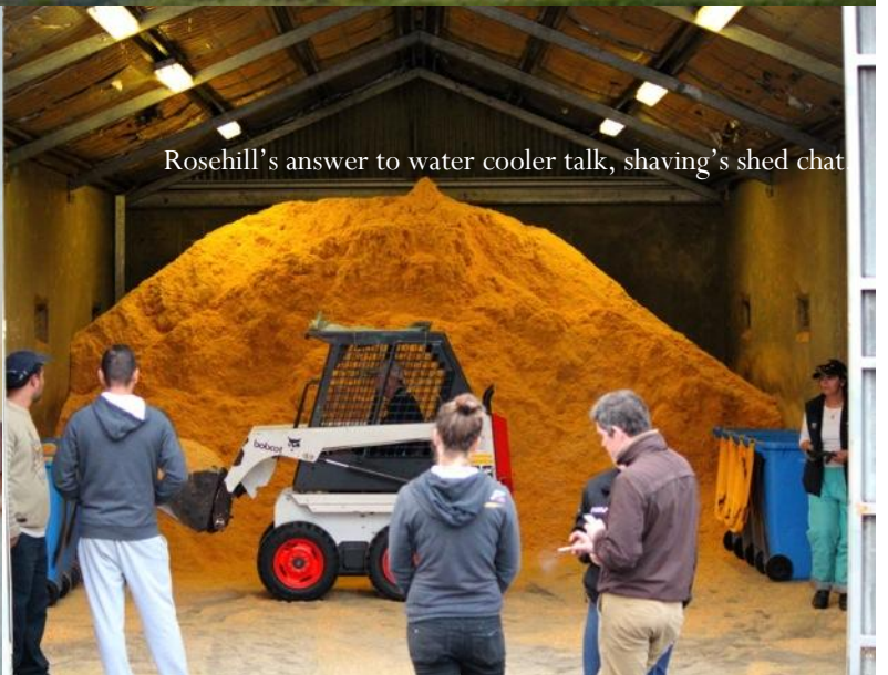
Rosehill's answer to water cooler talk, shaving's shed chat