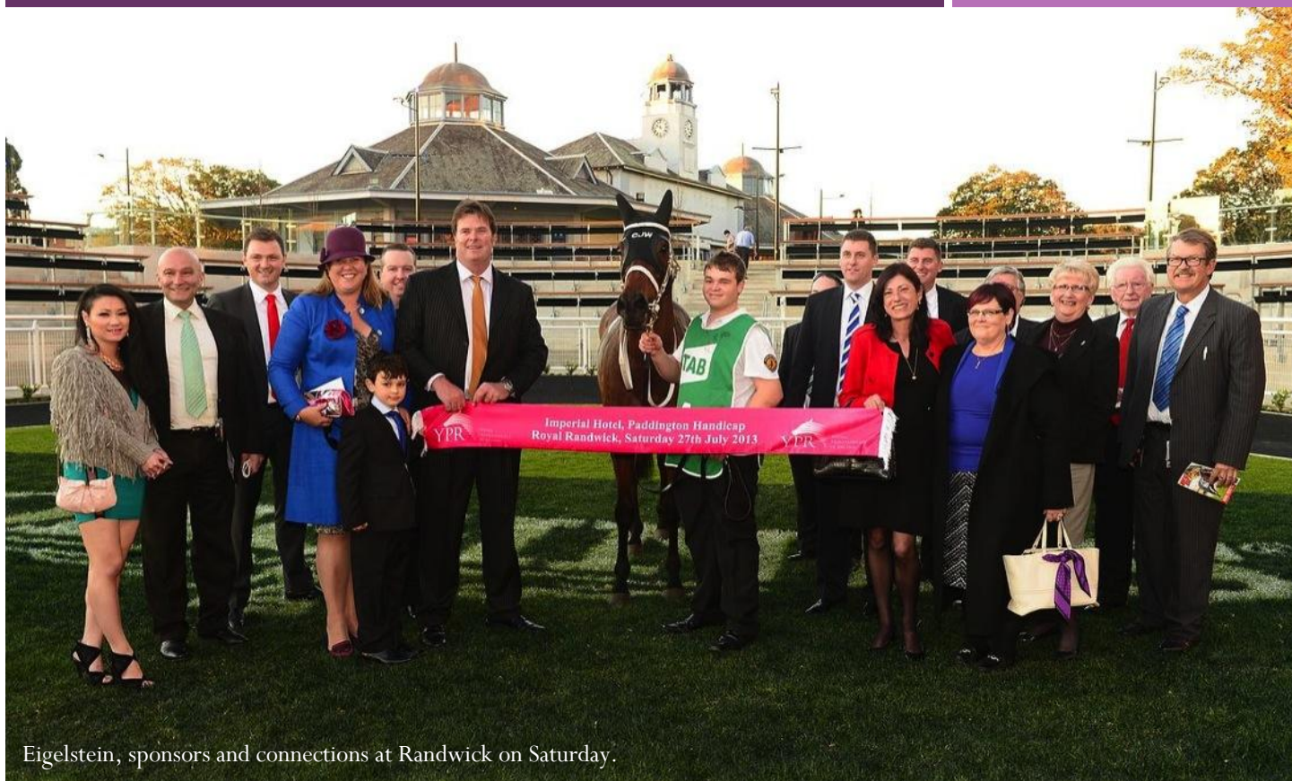
Eigelstein, sponsors and connections at Randwick on Saturday.

German import Eigelstein provided his enthusiastic bunch of owners with plenty to cheer about at Randwick on Saturday, winning his second Australian start while Loch Leven almost provided the stable with our last winner for the season, only to be relegated back to second for some minor shifting in the straight. That saw our NSW metro winners tally reach 167.5 and 223 overall.